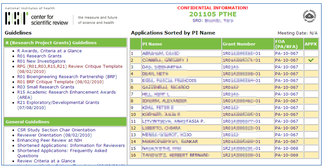
Figure 2 - List of applications, guidelines and other review materials included in the zApps ClickMe file.

2. <u>ClickMe.htm</u> opens an INDEX, with the list of applications sorted by PI name on the right side and review guidelines on the left (example in Figure 2).